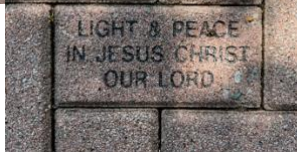
The brick walkway allows donors to post a brief message close to their heart, whether a memorial, a recognition, or a statement of faith.