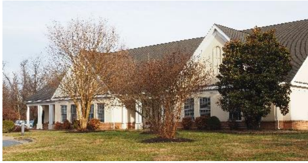
St. Andrews Parish House, established 2001