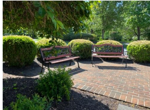
Our Columbarium (est. 2017) and garden that provide a peaceful place for visitation and reflection