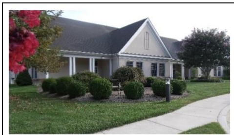
The mortgage for St. Andrew's parish house was fully paid in November 2021.

Like so many other churches, the beginning of the COVID crisis in 2020 marked a turning point disrupting in-person attendance. Our average Sunday attendance (ASA) between 2015 and 2020 ran between 104 and 126. Between 2021 and 2025 our ASA ran between 55 and 66. Besides the pandemic there were other contributing factors including that our large population of youth matured and moved on,