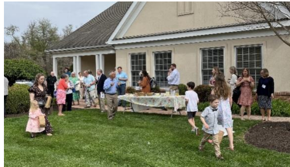
Our spacious grounds allow for special events and outdoor play!