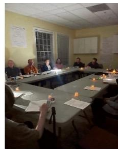
Our vestry and search team meeting during power failure in March 2026.

The St. Andrew's vestry consists of the rector, nine lay vestry members serving three-year terms and three ex-officio members (Senior Warden, Junior Warden, and Treasurer). Other officers include Registrar, Assistant Treasurer, and any other officers designated by the vestry. These last are non-voting members, unless they serve simultaneously as an elected vestry member.