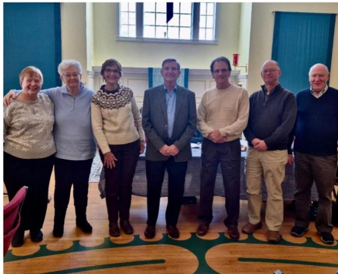
St. Andrew's Search Committee