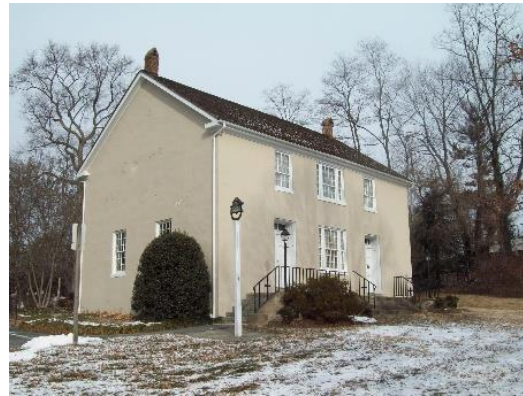
Historic Union Chapel, built 1833, restored 1980, renovated 1994