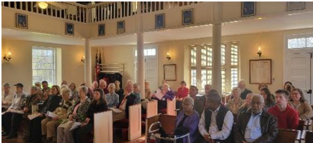
Union Chapel worship, Palm Sunday