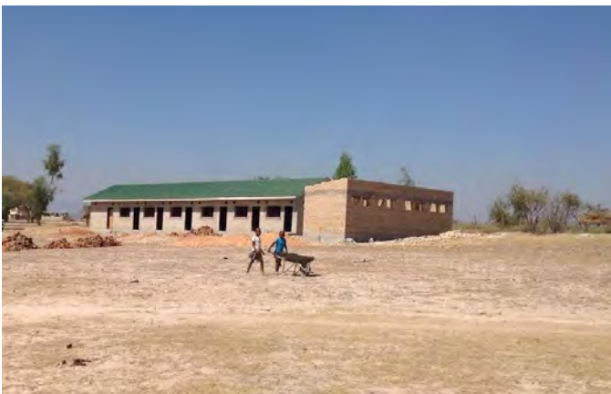
New Outpatient Building & Bathroom Facility