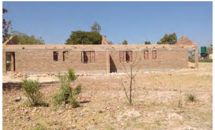
New Construction for Medical Staff Housing