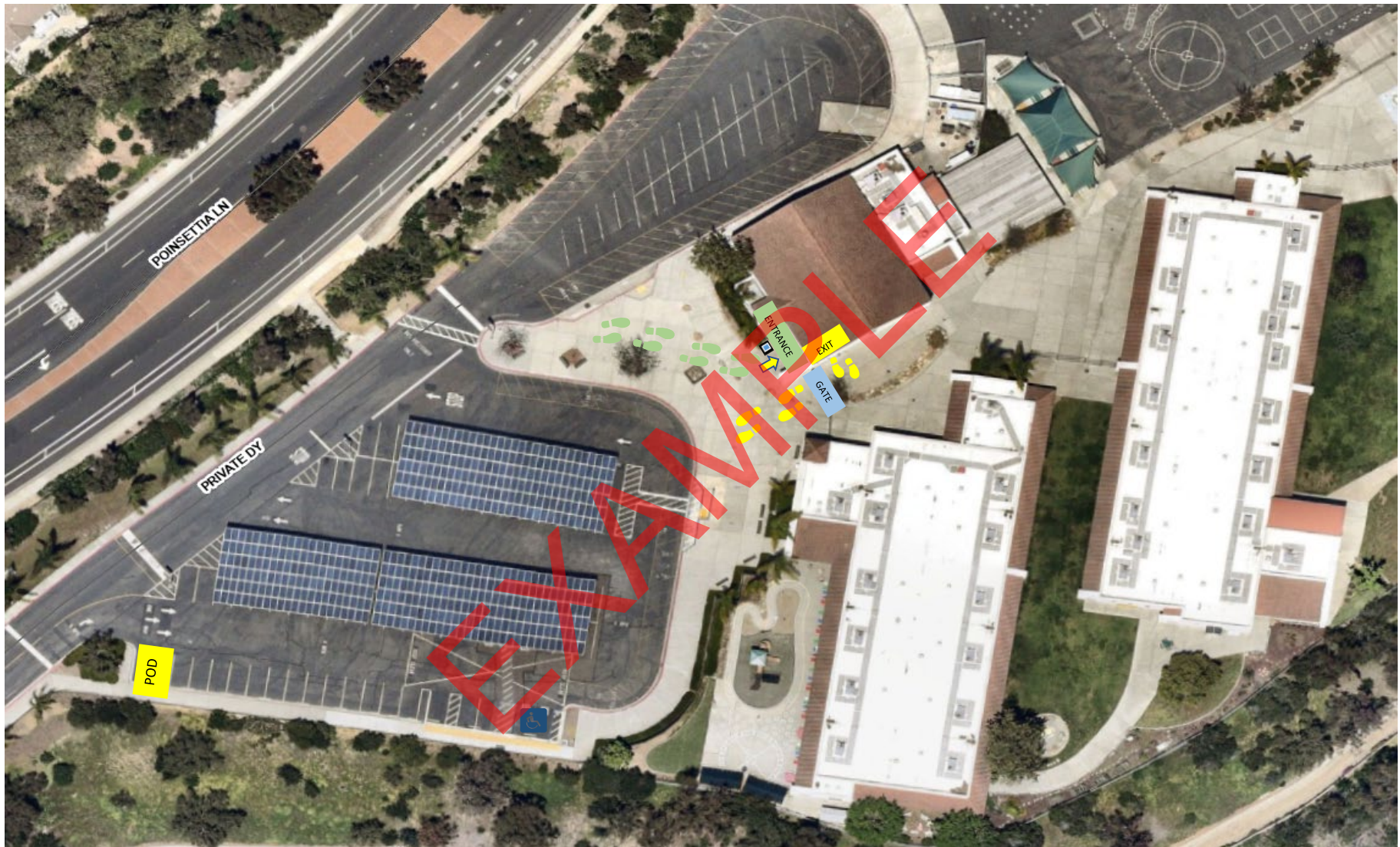
L-116 CARRILLO ELEMENTARY SCHOOL - MPR