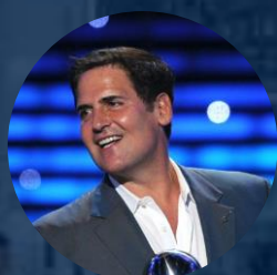
Mark Cuban Entrepreneur