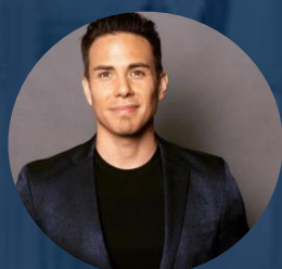
Apolo Ohno 8 x Olympic Medalist