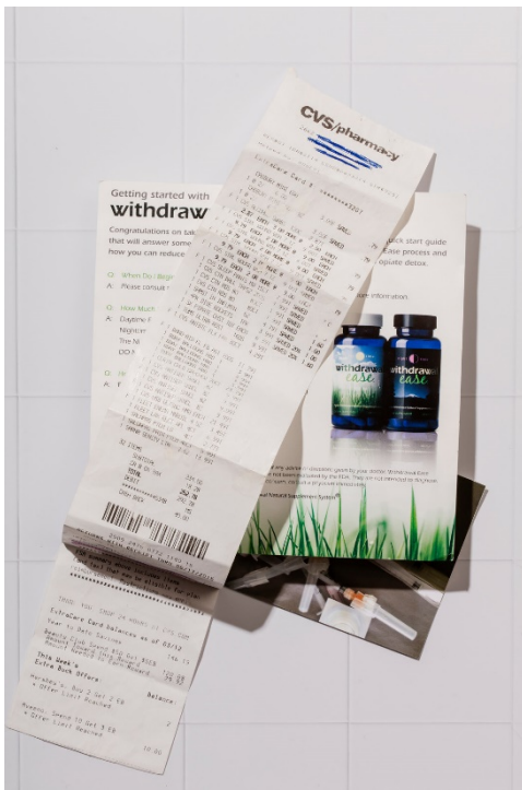
Receipts for antiseptic wipes, cotton balls, birthday balloons and Cadbury eggs were found in the house, along with many needles.

“These aren’t the majority of lawyers,” she added. “But there are quite a number abusing drugs, and once they get to heroin, it’s very hard to break it.”