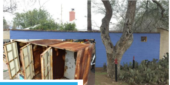
$$ Free Libraries $$

Print this form and mail to: Friends of Jefferson Park, Inc . P.O. Box 41243 Tucson, AZ 85717-1243 ATTN: Treasurer