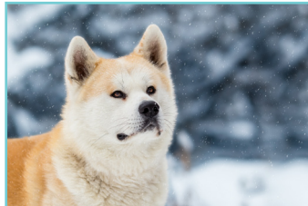
秋田犬 (Akita inu)

The dog breed originated in the mountainous, snowy rural lands of Akita and Odate