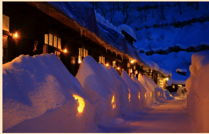
かまくら (kamakura) or snow domes found in Akita's Yokote City