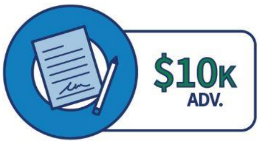
EIDL Loan Advance

This loan program provides loan forgiveness for retaining employees by temporarily expanding the traditional SBA 7(a) loan program.