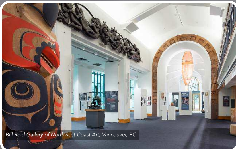
Bill Reid Gallery of Northwest Coast Art, Vancouver, BC

Your afternoon ends with a shuttle to Whistler along the picturesque Sea to Sky Corridor. Your final destination is the Aava Whistler Hotel where you will spend your night in Whistler. The evening is yours to explore the shops and restaurants of Whistler Village.