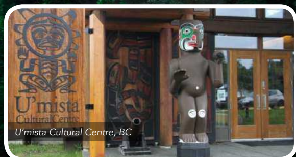
U'mista Cultural Centre, BC