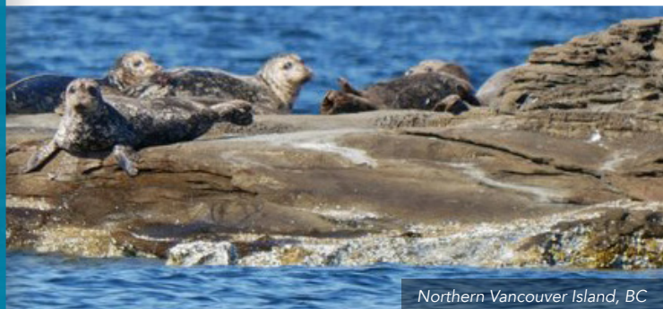
Northern Vancouver Island, BC

This northern tip of Vancouver Island excursion offers a combination of ocean-inspired wilderness tours along with hands on cultural experiences associated with the diverse Indigenous peoples of this region.