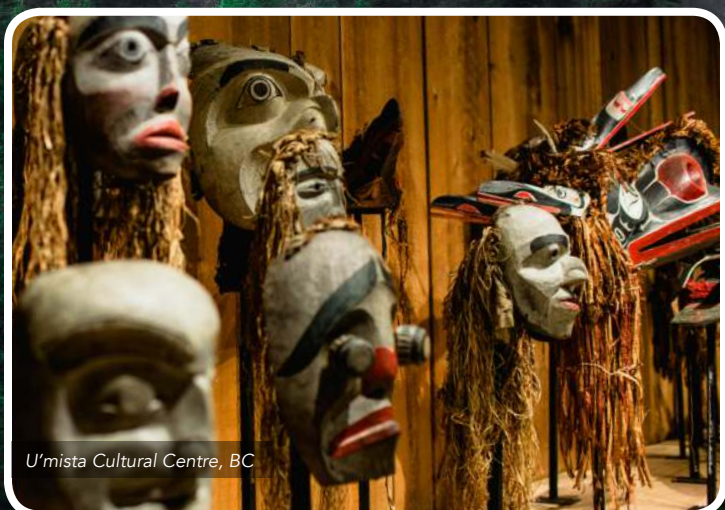
U'mista Cultural Centre, BC