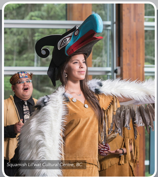
Squamish Lil'wat Cultural Centre, BC