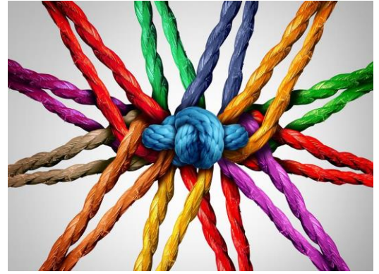
2017 Mission Pledge of Presbyterian Women PW's ANNUAL FUND

Presbyterian Women's Mission Pledge , the annual fund of PW, begins with a prayer and a gift, in circles and outside of them. Every dollar given supports PW at all levels of the organization—refreshments in your church, guest speakers at Presbytery gatherings, publishing HORIZONS magazine and Bible Study, Churchwide participation (including the triennial gatherings and the mission tours, the Global Exchange, and the USA Mission Experience), and so much more.