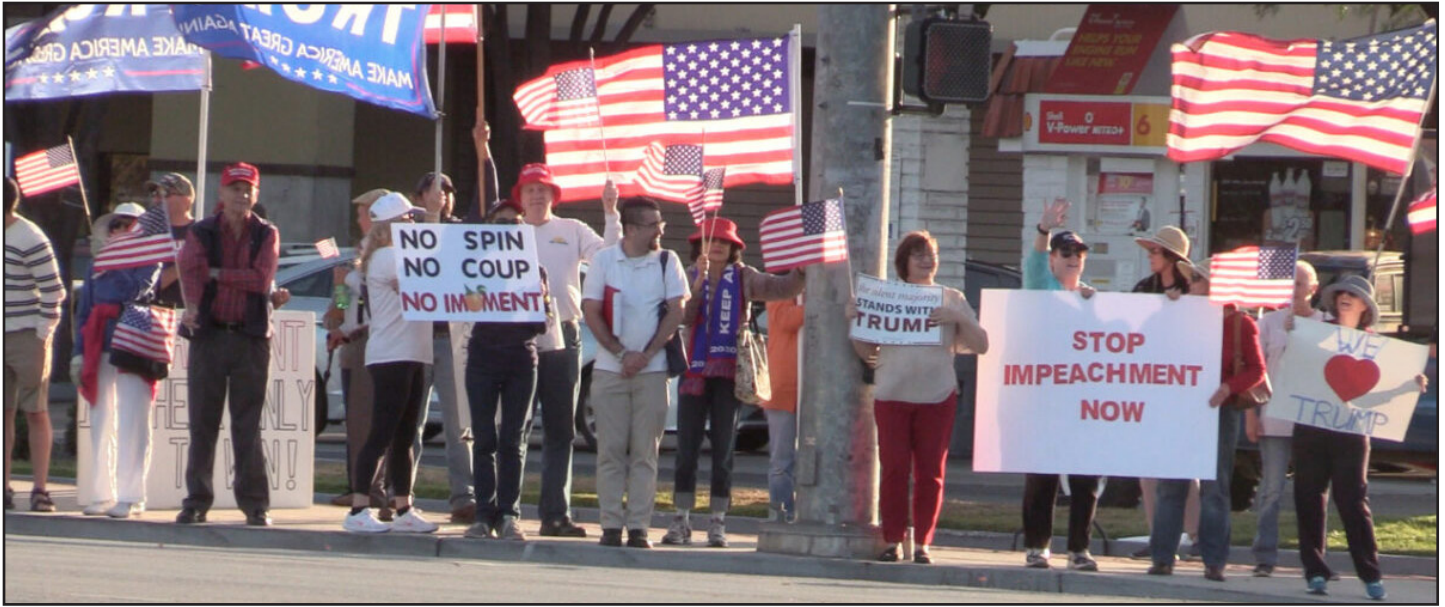
Trump supporters gather on the corner of Almaden Expressway and Blossom Hill Road on Oct. 17 to show their support for President Donald Trump.