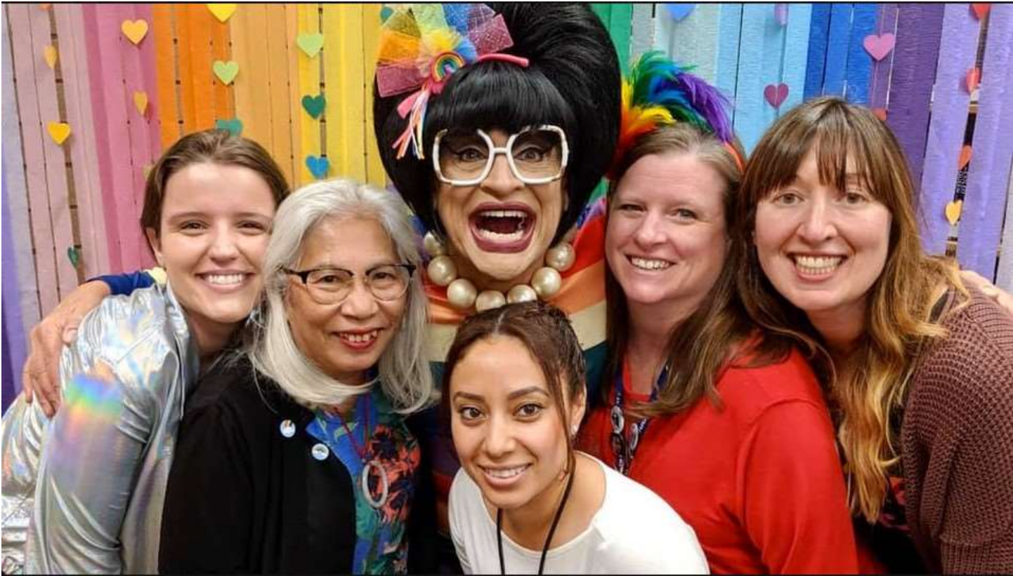
Miss Richfield 1981 at Richfield Library.