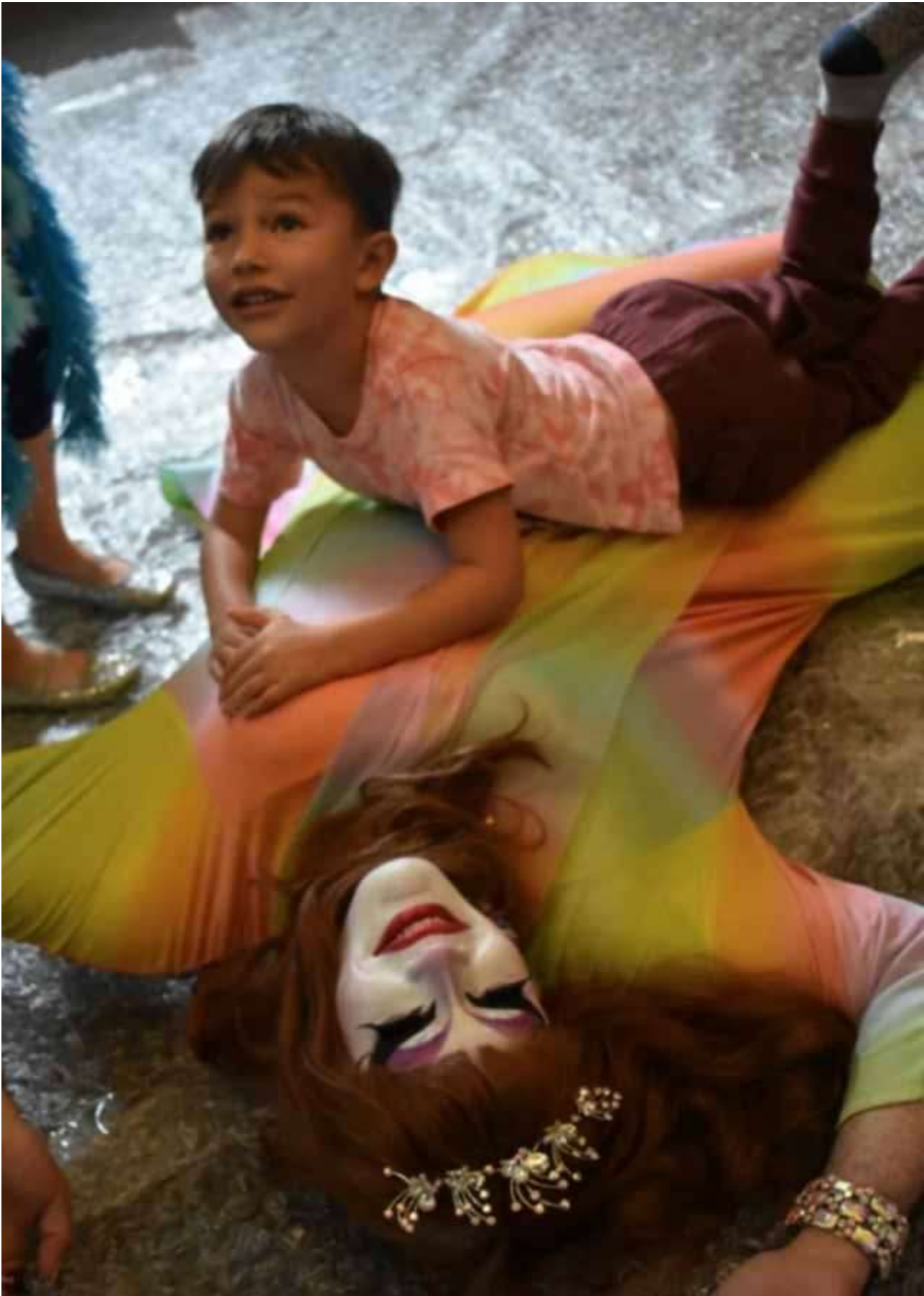
After Life Site published its report exposing the library's facilitation of child abuse, the library removed the images.