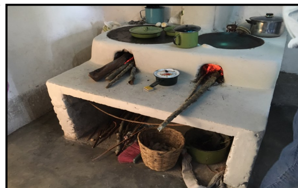
Honduran cooking stove

Un-pasteurized water is responsible for many illnesses and deaths we see worldwide. In developing countries, about 80% of illnesses are linked to poor water and sanitation conditions. Clean and safe water is essential to healthy living. An estimated 1.5 billion cases of diarrhea occur each year during the rainy season resulting in the death of nearly two million children worldwide. 1.3 billion people around the world do not have access to safe drinking water or latrines www.WHO.org