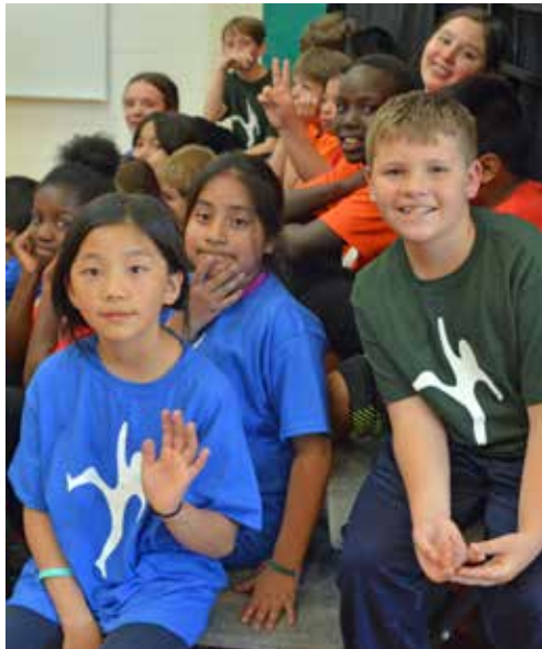
(bottom) Rashkis students eagerly wait for their chance to perform.

Thanks for being a club member this year (July 1, 2017-June 30, 2018). From the Paint the Sky Club to our Circle of Friends, we kick up our heels for each and every one of you!