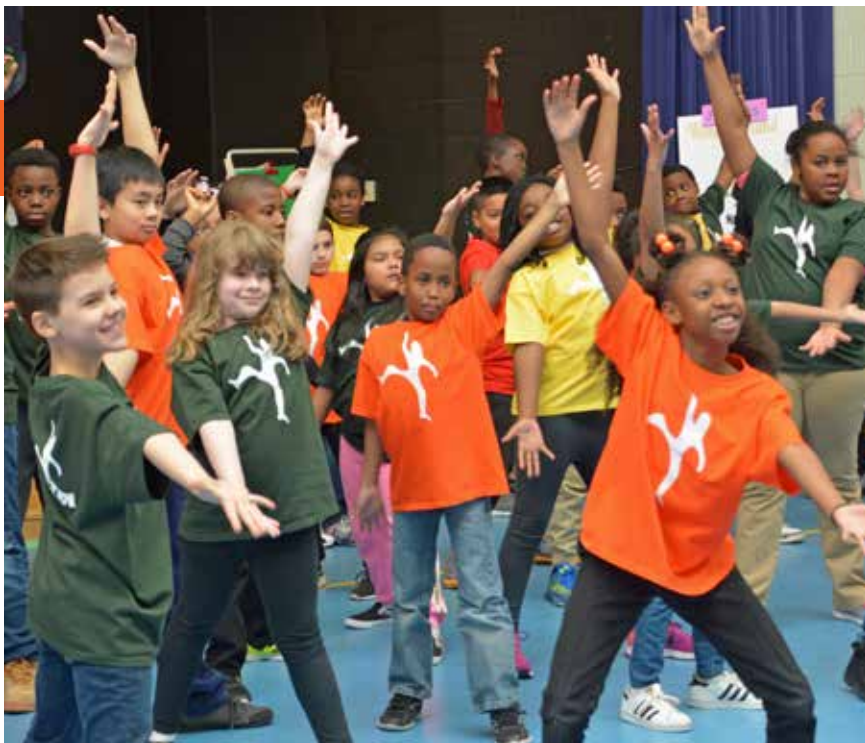
Millbrook students perform for their peers.