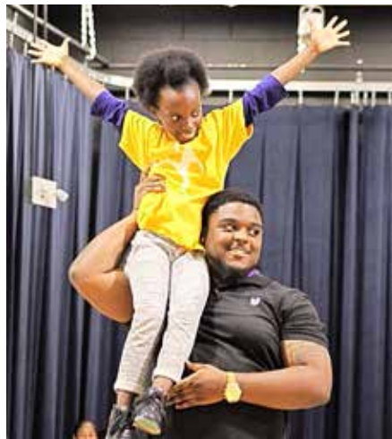
A Rogers Lane student is hoisted up by a teacher during their showcase performance.