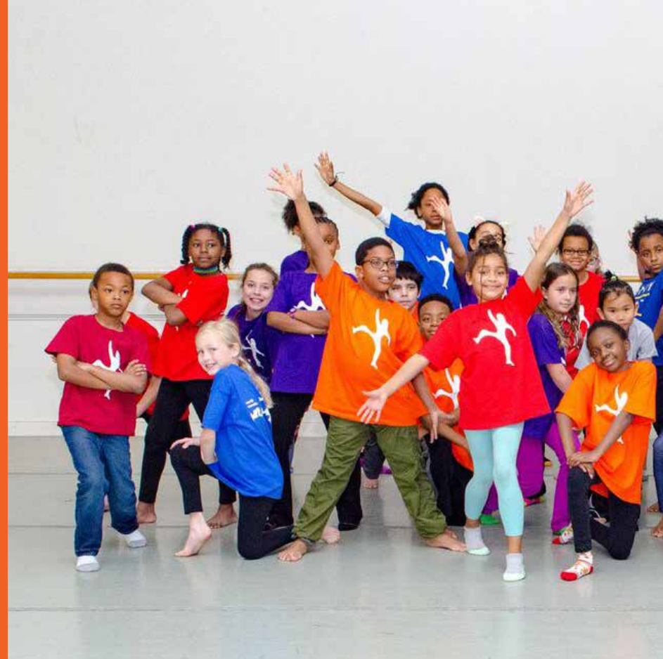
LEAP Team dancers strike a pose in January highlighting their role as program ambassadors.