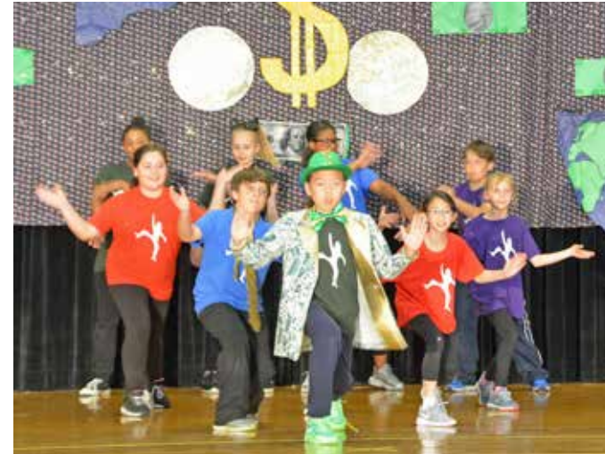
(left) Fourth graders from Rashkis Elementary salute "Greentown." (right) Millbrook students watch their peers perform in "Common Cents: Dancing for Change."

In our FY 2018 theme "Financial Literacy" students learned about the value of money and how it affects the many diverse citizens within a society. Through dance, music and visual art, students gained an appreciation for financial literacy by exploring their relationship to economics. Students studied North Carolina's regions and resources, learned how they relate to producing goods and services, and developed an appreciation for how businesses make choices to reach their goals.