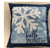
January Hello Winter Pillow $20

What is Kimberbell? Delightful machine embroidery designs and monthly projects that are available at Just Sew Studio. You may attend a hands-on class or stop in with your USB memory stick to receive the design along with the fabric kit. The hands-on class will be held the 1st Saturday of the month OR the Monday following the 1st Saturday. Just picking up the kit? Stop by the store any time during that month; however, pre-registration is required for both options! Stop by the store to see the completed samples and the newest Kimberbell line of products. Sew much fun! Sat, Jan 5, 10 am OR Mon, Jan 7, 1 pm