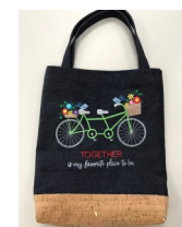
February Denim & Cork Tote Bag $20