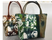
Fri, Oct 6: Stella Bag