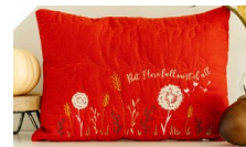
Thurs, Oct 19 Fall Pillow