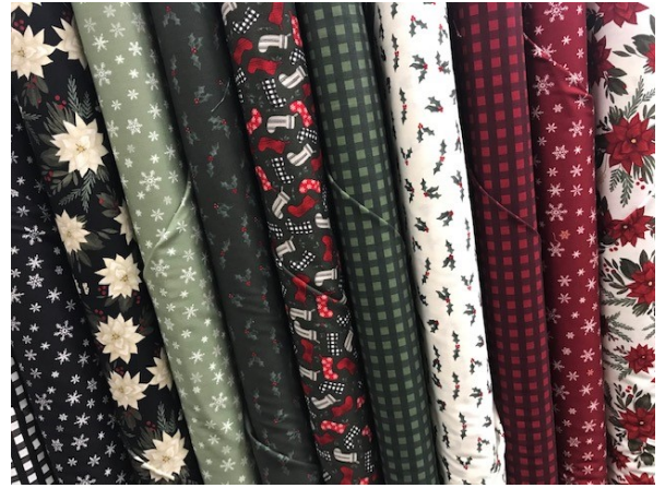
Riley Blake Farmhouse Christmas