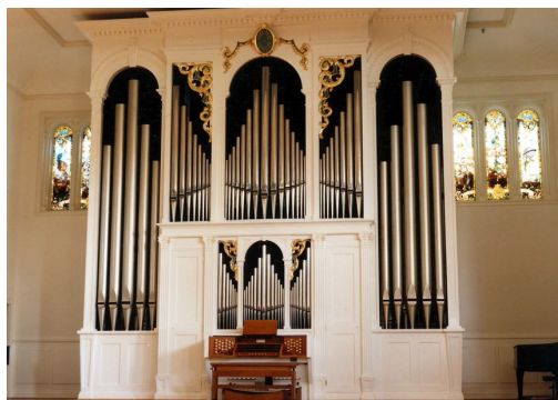
Stetson University Organ