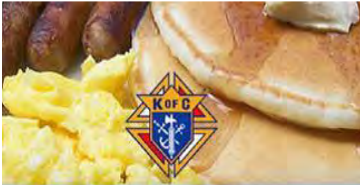
PANCAKE BREAKFAST KNIGHTS OF COLUMBUS

AFTER THE 8:00 AND 10:00 AM MASSES "END OF THE SUMMER!" FAMILY BREAKFAST SMM SCHOOL CAFETERIA