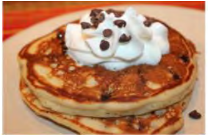
PANCAKE BREAKFAST KNIGHTS OF COLUMBUS

$5.00 per Adult (14 and older) $3.00 per Child (9 thru 13)