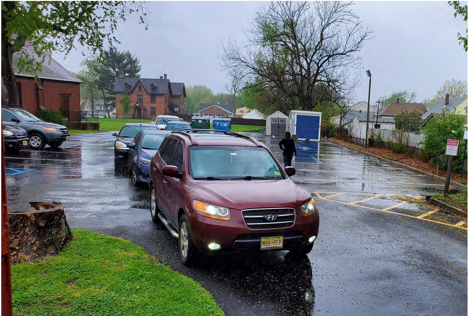
Cars line up in the church parking lot for a drive-by delivery of food items, packed by our "Monday morning packers" group and distributed by volunteers.

Your donations, and also your prayers, for our ministries are most appreciated.