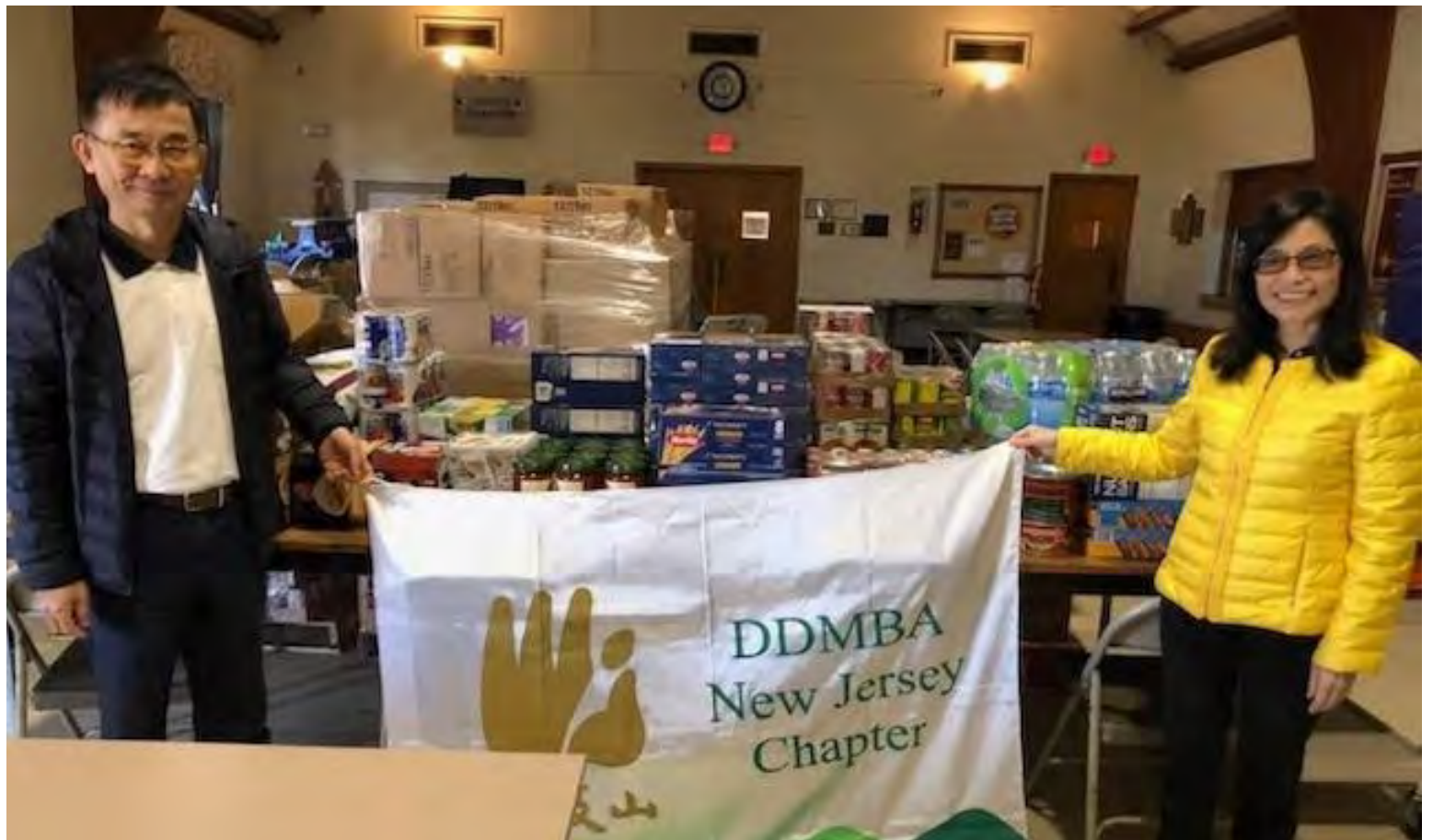
Dharma Drum Mountain Buddhist Association, a temple located in Edison, contributed toward our Christmas baskets. Representatives of the DDMBA are pictured with their donation. Trinity appreciates their support.