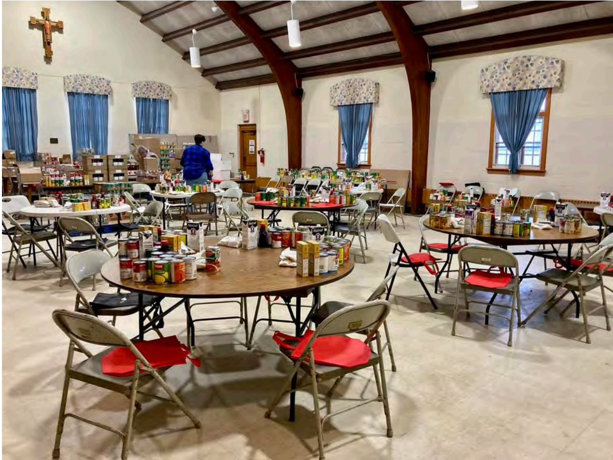
Here's what the Parish House looks like as the "Monday morning packers" get ready to do their volunteer work for the Food Pantry.