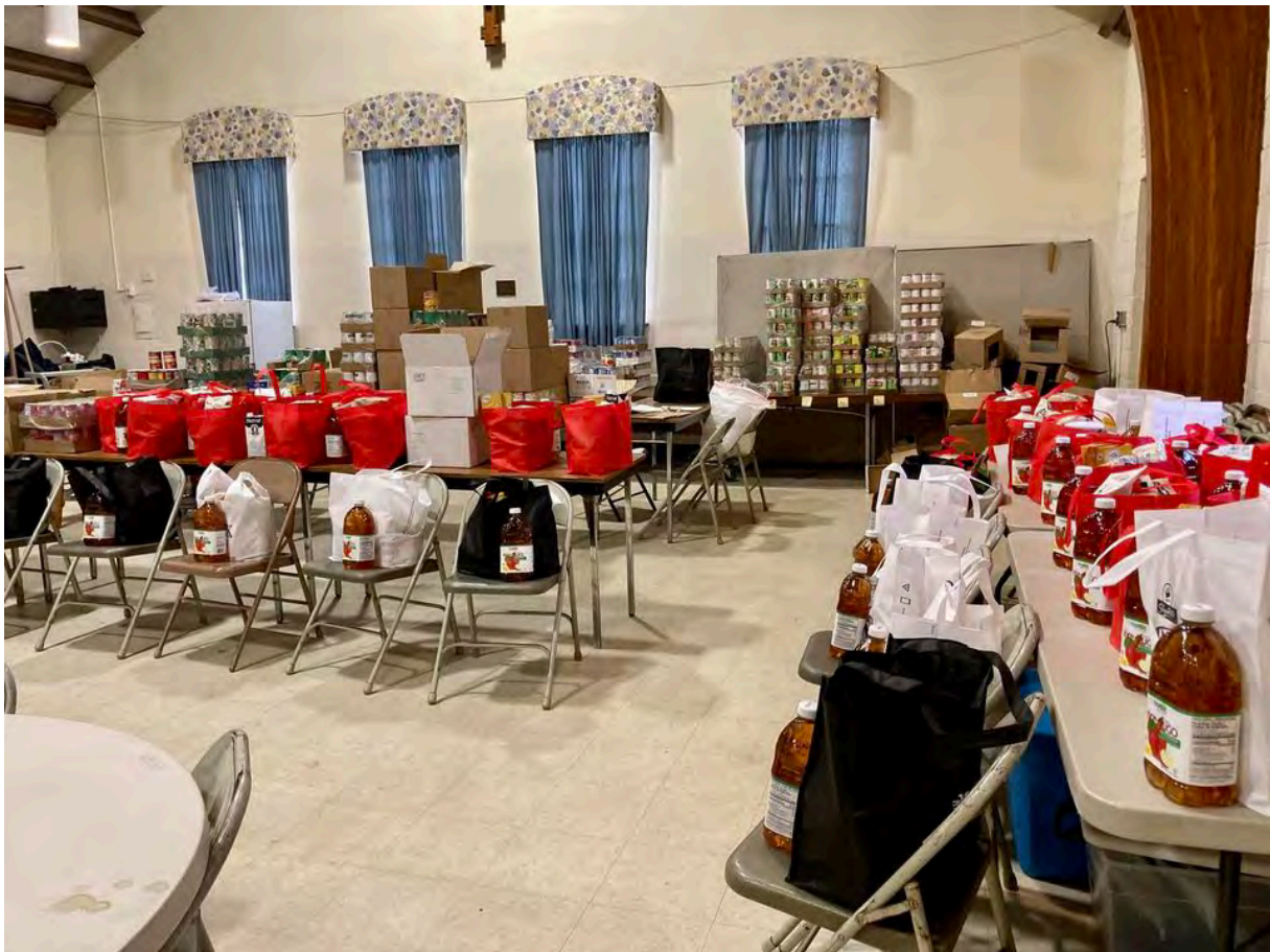
Here's the finished product for distribution to needy families.