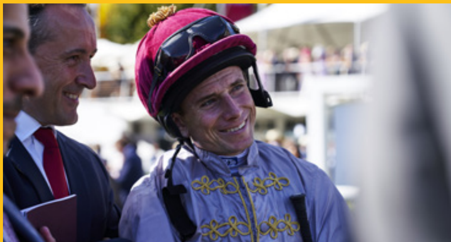
Racing UK Top Jockey - Qatar Goodwood Festival 1979 to 2018