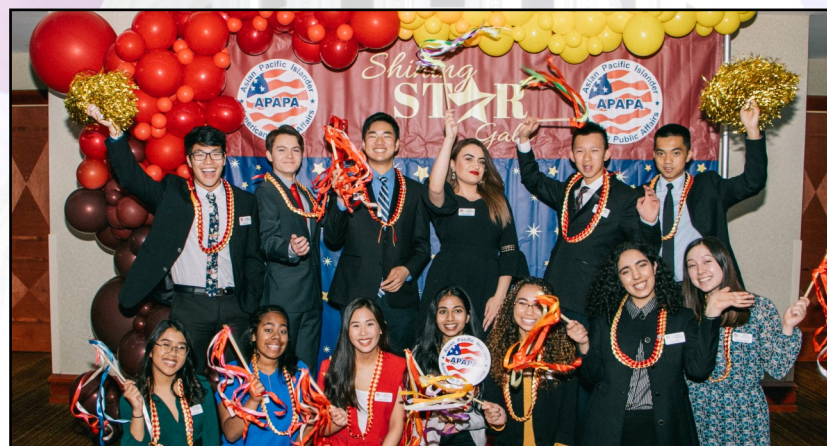
2019 APAPA Internship Award Recipients

THANK YOU SOUTHWEST AIRLINES, OUR OFFICIAL AIRLINE SPONSOR!