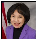
Doris Matsui U.S. Representative (CA) Honorary Co-Chair