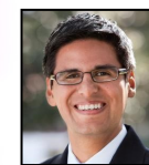
Henry Perea Chevron Corporate Leadership Award

THANK YOU SOUTHWEST AIRLINES, OUR OFFICIAL AIRLINE SPONSOR!