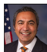
Ami Bera U.S. Representative (CA) Honorary Co-Chair