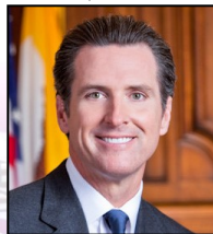
Gavin Newsom CA State Governor Special Guest Speaker