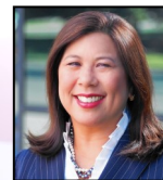
Betty Yee CA State Controller