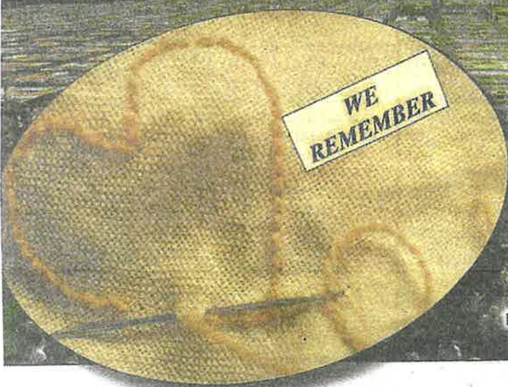
Logo of the DelcoPA COVID Quilt Project

In this 1992 photo, people visit the 21,000 panel Names Project AIDS Memorial Quilt in Washington. The Delco quilt project is modeled on the AIDS quilt.