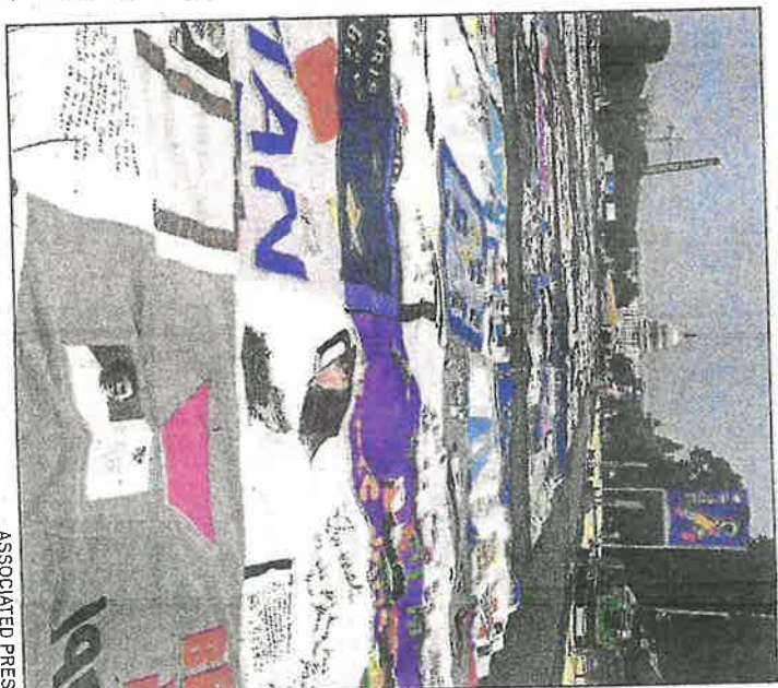
People visit the AIDS Memorial Quilt on display as part of the Smithsonian Folklife Festival on the National Mall in Washington, on Thursday, July 5, 2012.