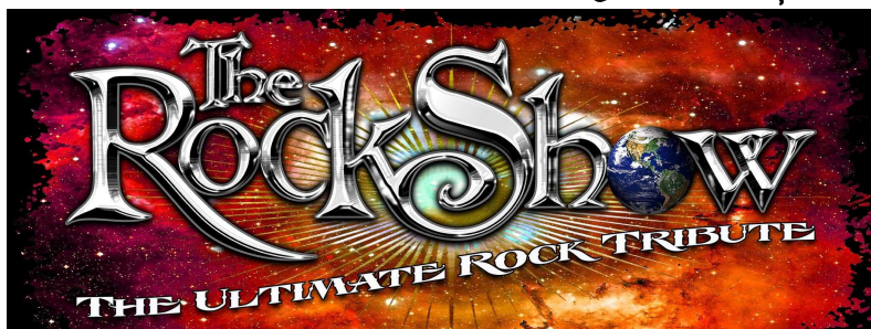
The Rock Show - July 26 @ 8 pm