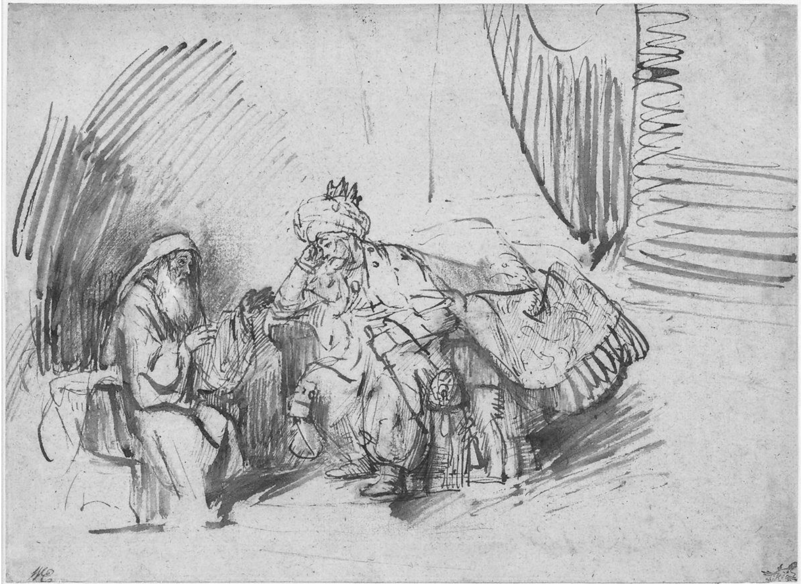
Nathan Admonishes David, Rembrandt Met Museum