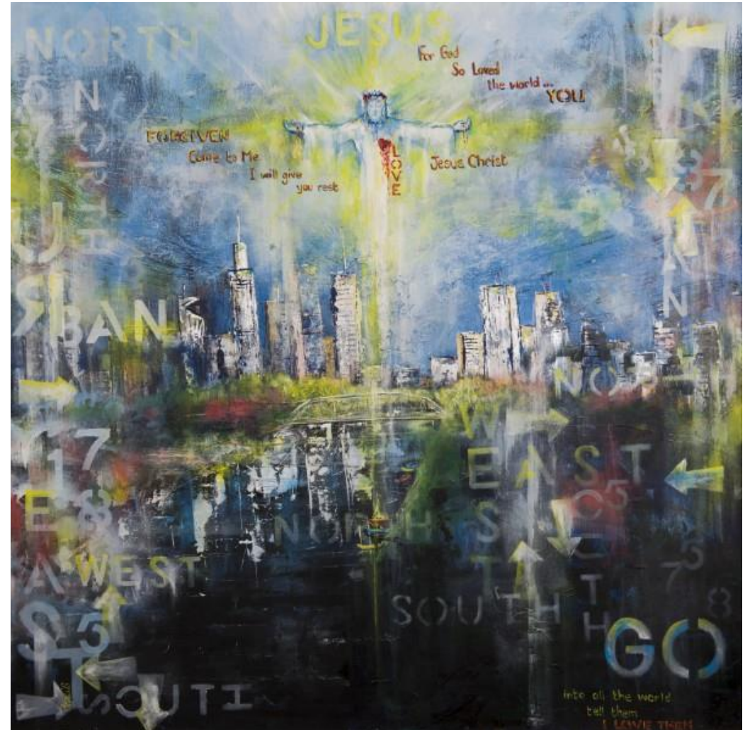
The Great Commission by Tracy Bayer