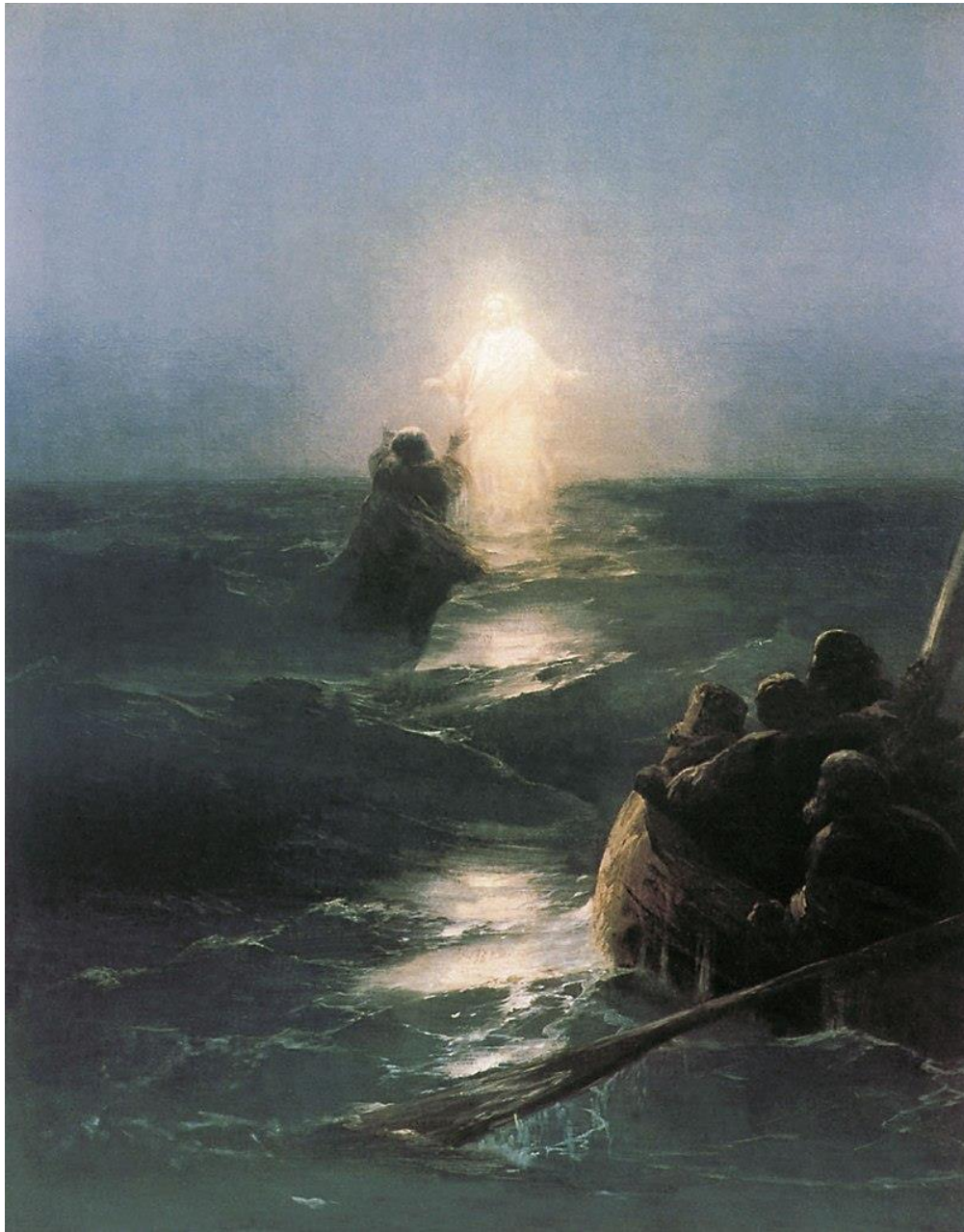
"Peter Walks on the Sea" Ivan Aivazovsky, 1888

Jesus spoke to them and said, "Take heart, it is I; do not be afraid."