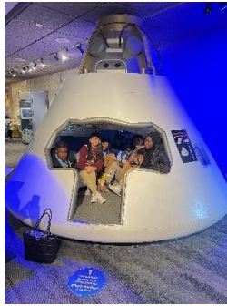
Boston Science Museum