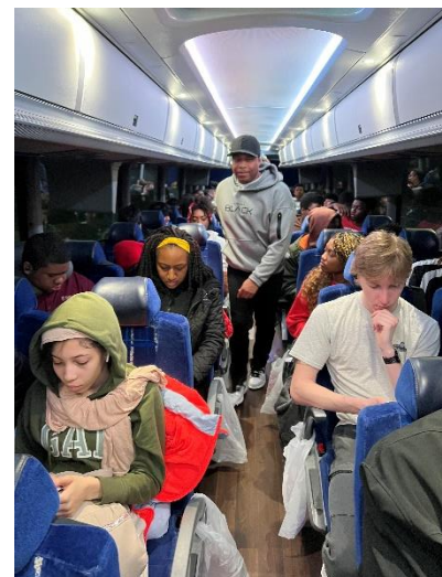
Scholars and Chaperone on the Bus