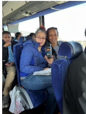
Chaperones on the Bus