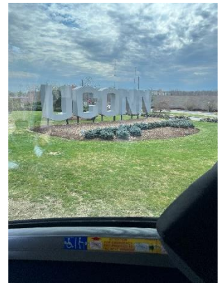
University of Connecticut