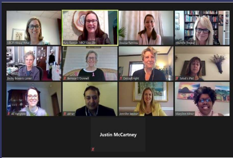
Zoom meeting with Representative Jennifer Wexton (D-10th) during Virtual Lobby Day 2020