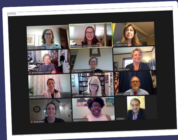
Zoom meeting with Rep. Morgan Griffith (R-9th) Virtual Lobby Day 2020