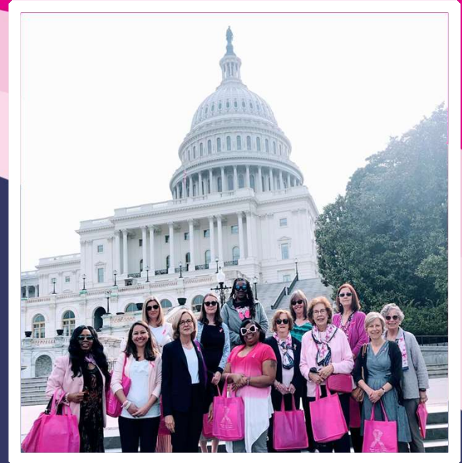
VBCF Volunteer Advocates on Capitol Hill