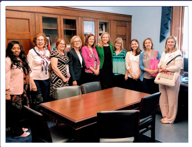
Rep. Abigail Spanberger (D-7th) Lobby Day 2019