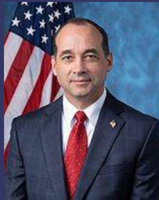
Rep. Bob Good (R-5 th )