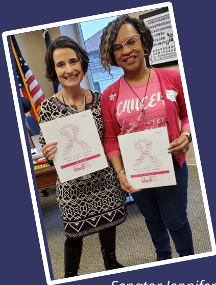
Senator Jennifer Boysko (D-86th) Advocacy Day 2020