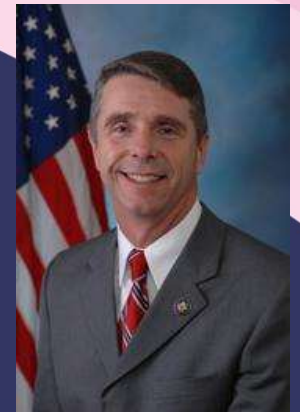
Rep. Rob Wittman (R-1st)#