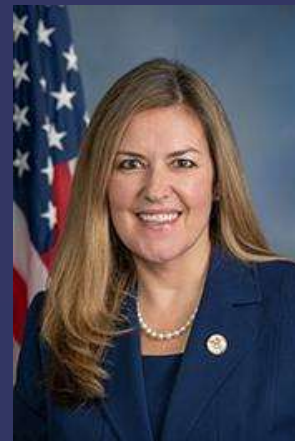
Rep. Jennifer Wexton (D-10 th )#