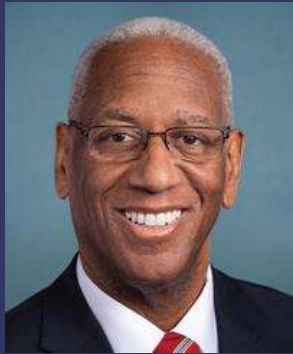
Rep. Donald McEachin (D-4 th )*