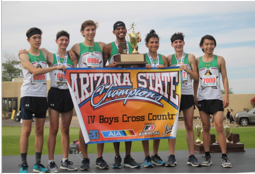
Cross Country runners at state meet.