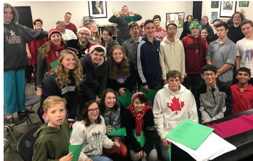
NPX community members prepare to go caroling.