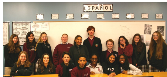
Spanish II students.