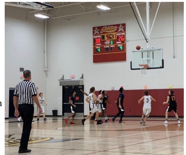
Varsity basketball team plays the Firebirds.

The Gladiator teams need your help to ensure more victories like this one! Listen to announcements for more information on game opportunities to cheer them on.