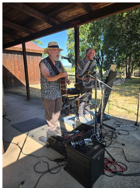
Images from the event, Picture It! and musical duo, Too Much Fun! at the Mendocino County Museum.