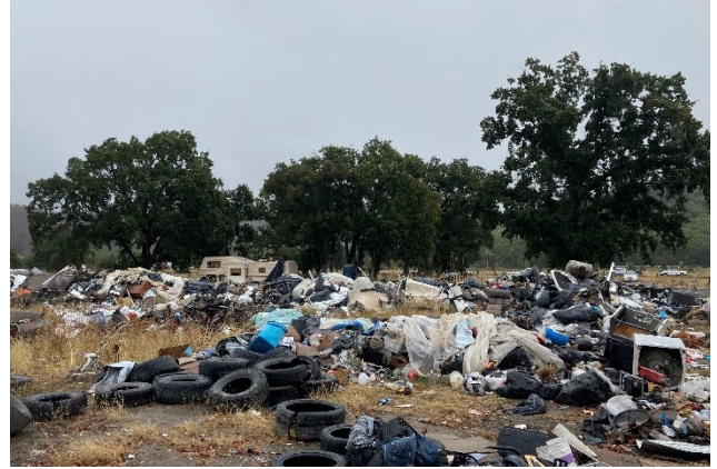
Illegal Dumping Site Walk Through for Potential Vendors – Covelo Clean Up Grant – 10/1/25