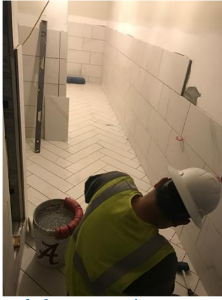
2nd Floor Women's Restroom