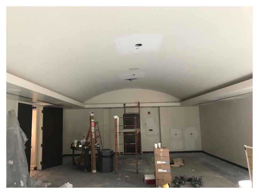
2<sup>nd</sup> Floor Founder's Room