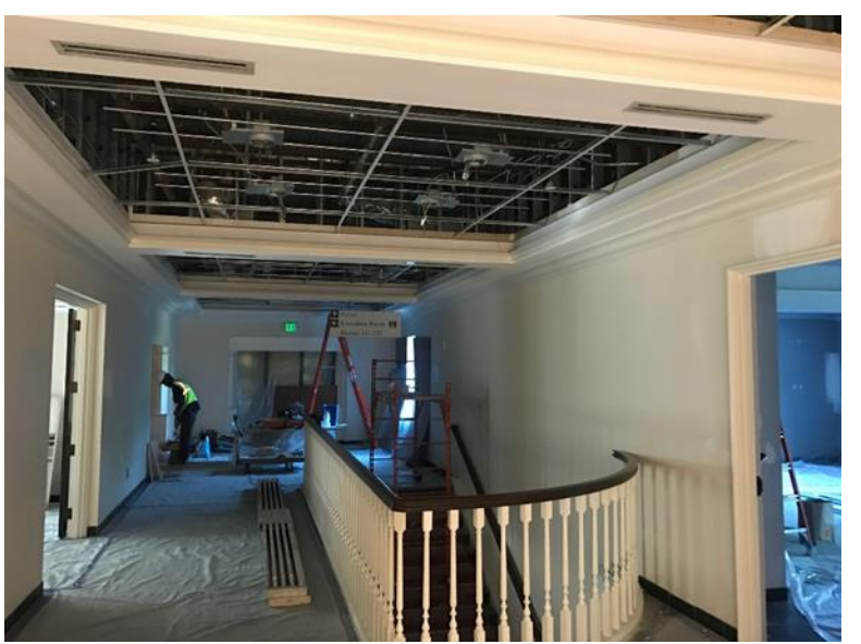
2<sup>nd</sup> Floor Lobby