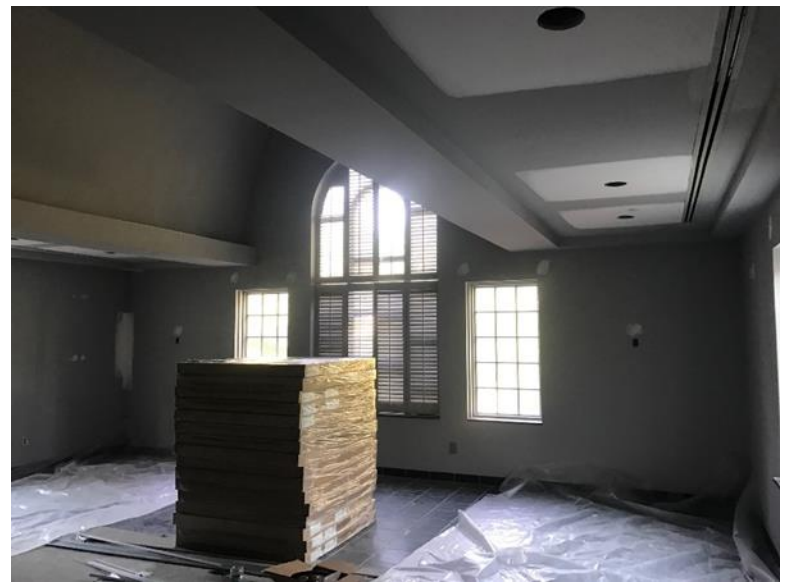
2<sup>nd</sup> Floor Tilson Room