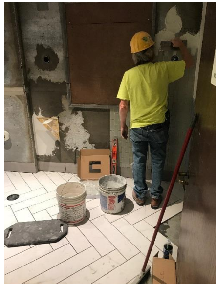
1<sup>st</sup> Floor Reception Desk