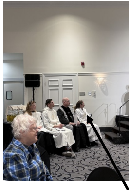
Look! It's Mother Robin.