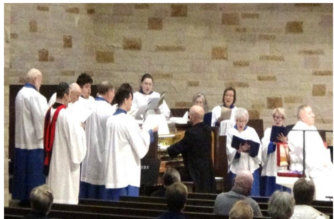
Christ Church Choir