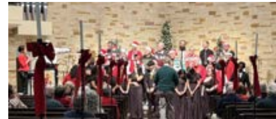
Akron Derby Barbershop Chorus