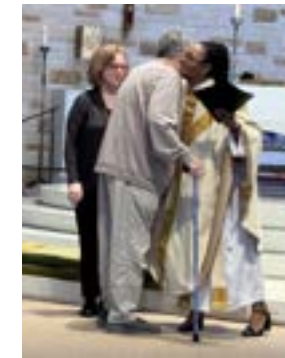
Church Family moving on to Mississippi