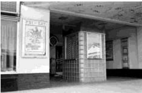
The Tooga Theater in the summer of 1973