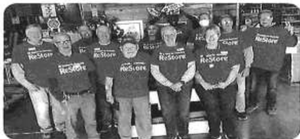
A few members of Habitat's "fabulous" Senior Crew