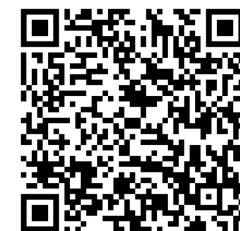
Documented cases of abuse

Assisted Suicide on CO for Young Women with Anorexia