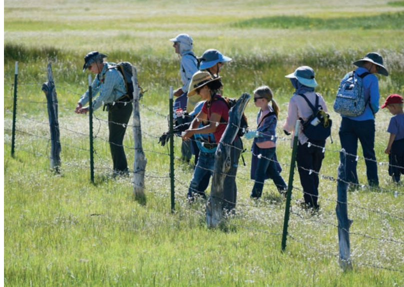
Volunteers mark a pasture fence to reduce sage-grouse fence-strikes in the RCPP project area on a preserve owned by Eastern Sierra Land Trust. The simple fence tags reduce sage-grouse mortality by 80%.

Leelanau Conservancy will cost share the expenses associated with planning for the transition of farmland to the next generation.