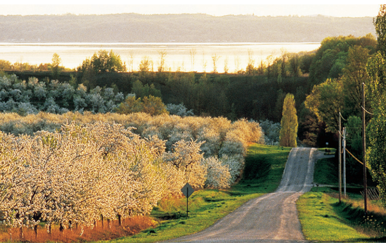
Leelanau Conservancy has been a consistent voice for farmland protection in Michigan’s fruit belt.

Additionally, working with Michigan State University Extension, Farm Transitions aims to encourage working farmers to plan for the succession of their farm to the next generation. With technical assistance from the extension and area succession-planning professionals,