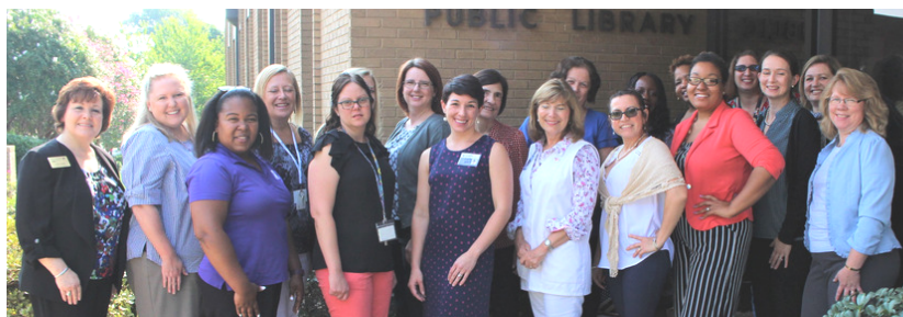
2017 DIRECT SERVICE PROVIDERS