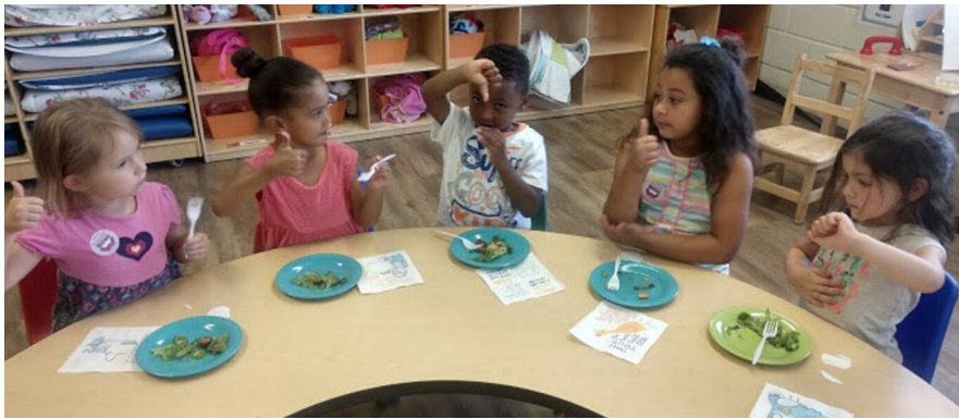
FARM TO ECE TASTE-TESTING THEIR RECIPE