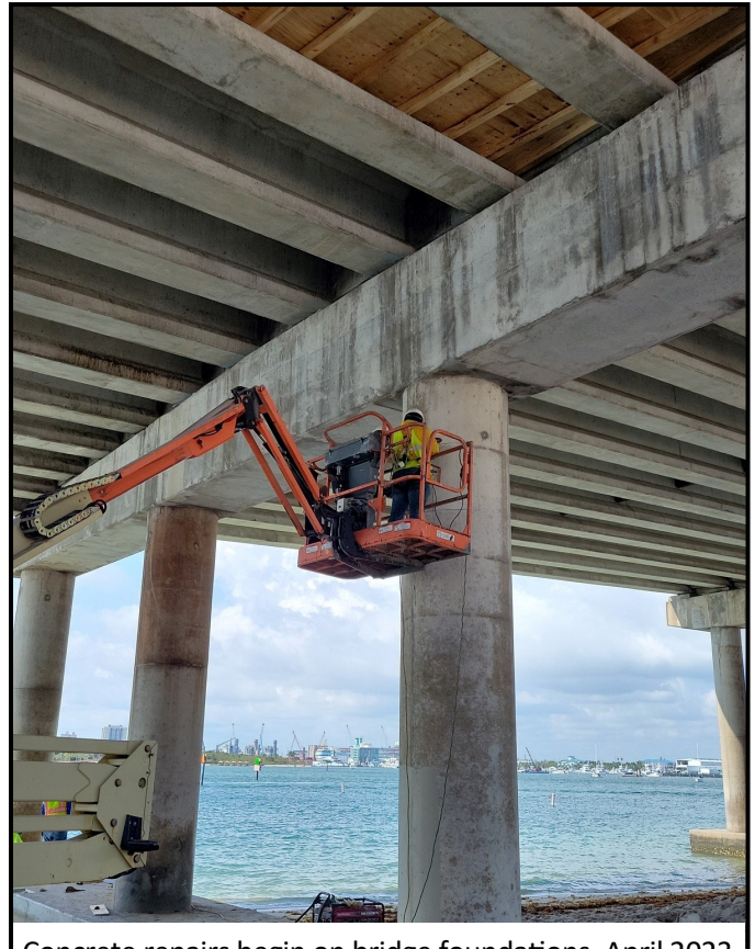
Concrete repairs begin on bridge foundations. April 2023