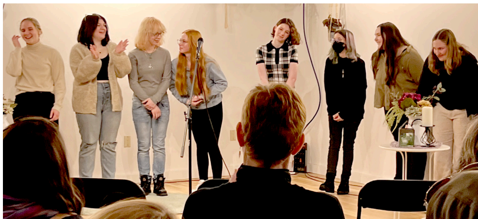
▲Above: The members of the Youth Health Collaborative wrap up their presentation with a lively Q & A session with the forum attendees.

The 2022-23 Youth Health Collaborative group was faced with a tall task for this year's youth-led forum: respond to the question "What is it like growing up in North Berkshire County?". The question was an amalgamation of several of the responses from the community needs assessment process, resulting from many community members' desire to have a better understanding of the challenges facing young people, and the opportunities that are available to them. The opportunity to provide an insight into the lives of young people was not lost on this group.