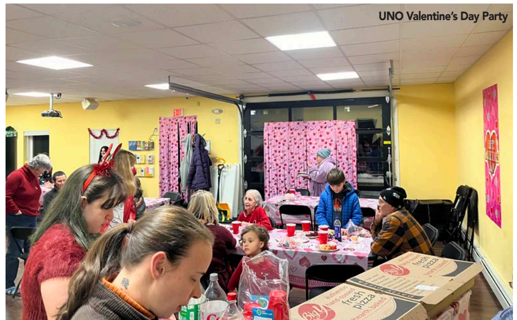
UNO Valentine's Day Party