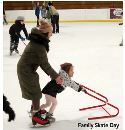
Family Skate Day

March will be a bit quieter, but we look forward to a busy April when we'll celebrate Easter with the 3rd annual Easter Festival in coordination with the City of North Adams, as well as the annual scavenger hunt on Spring Street in Williamstown.