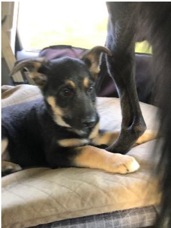
Spirit: I'm a chill little doggie, but if you bring your face close, I will lick it.