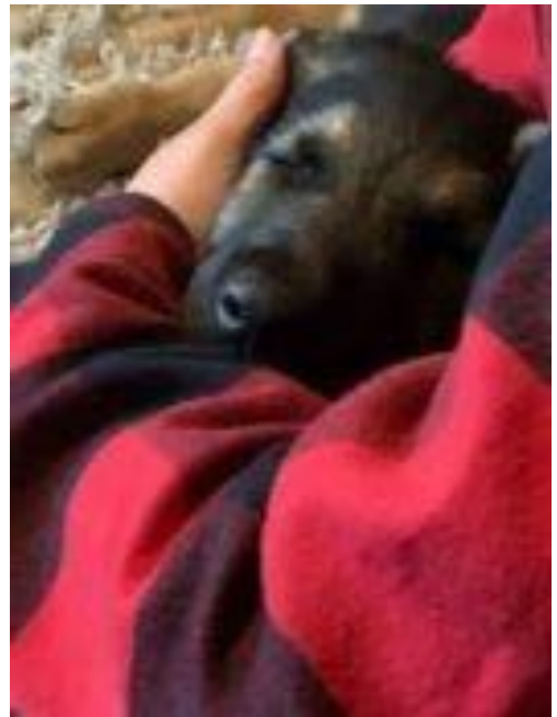
Here is another picture of Spirit