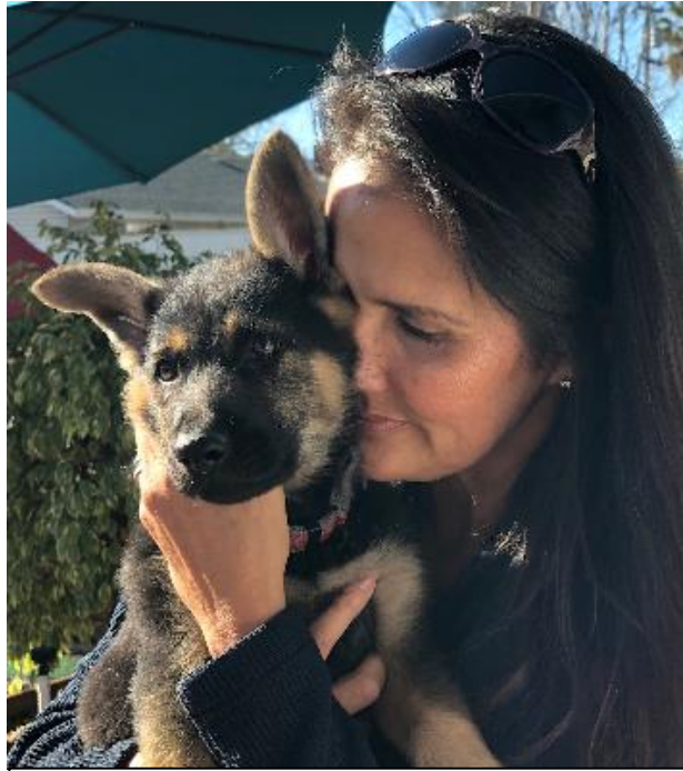
Pride: my forever mom

More pictures of the pups as they get older: