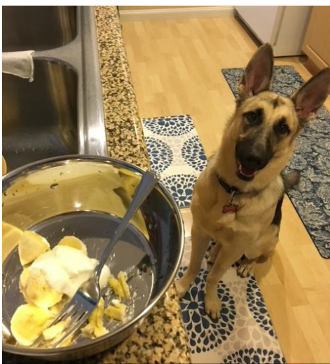
Banana yogurt parfait, please!

friends Bandit, Bravo, and Princess, and her daily delicious banana yogurt parfait (her equivalent of a relaxing glass of wine at the end of a big day!)