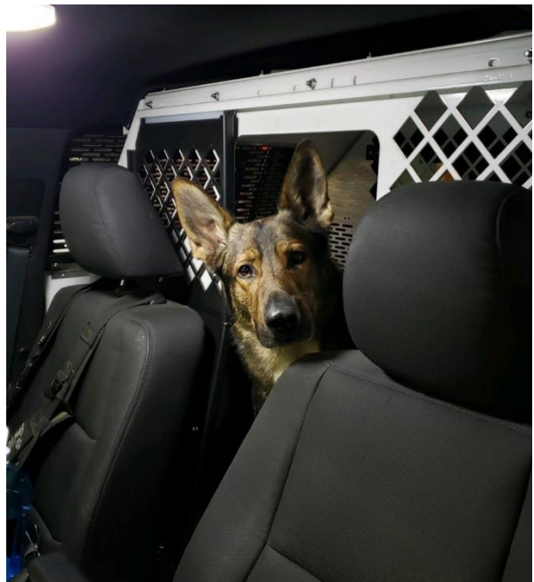
K9 Bohdan in the squad car